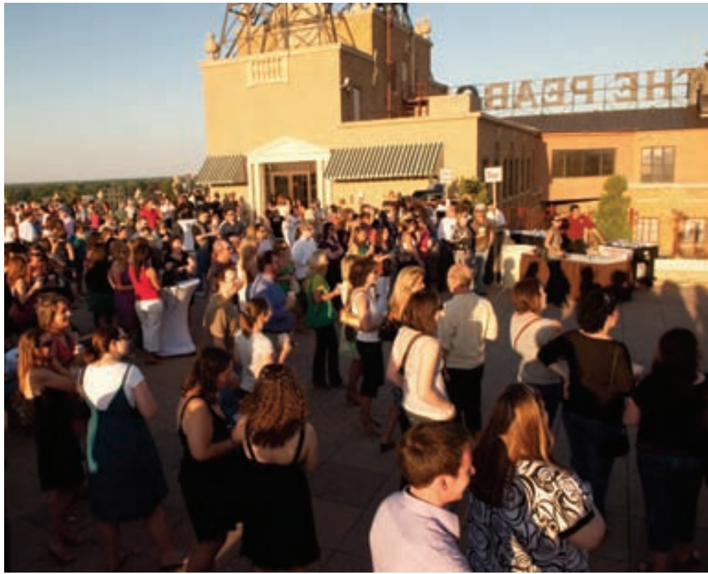
Not your grandmother's Peabody Skyway evening: The hotel's Rooftop Parties are now an all-out throwdown.