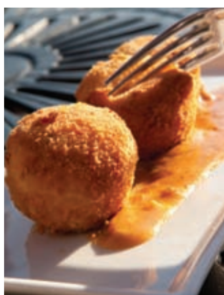
On the Rooftop Terrace menu, the jumbo lump crabmeat with potato croquettes are divine.