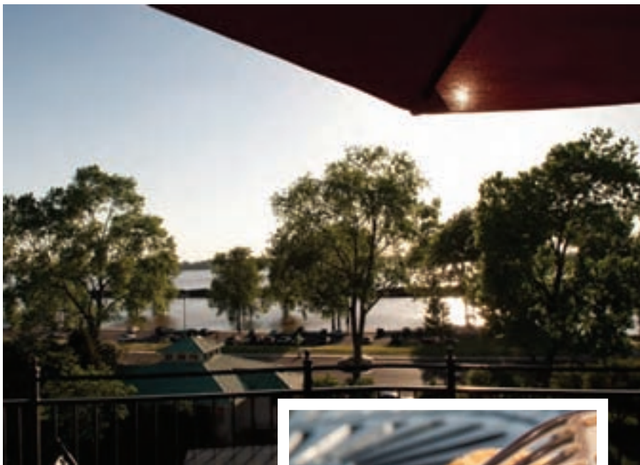
Things move at a little slower pace at The River Inn Rooftop Terrace in Harbor Town, just like the amazing river itself.