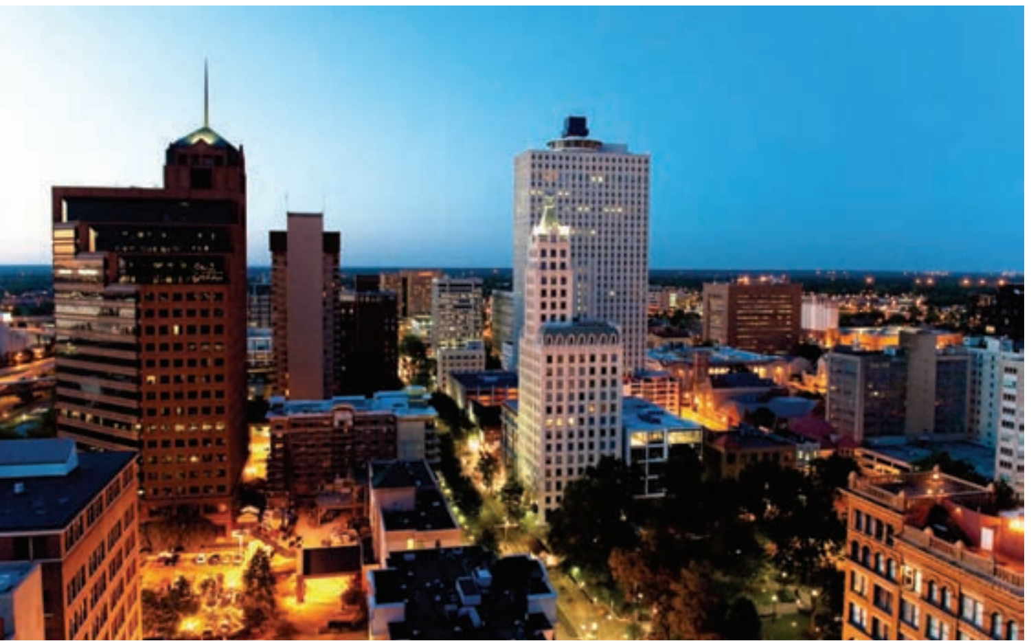
Downtown Memphis skyline view near sunset from the Madison Hotel rooftop.