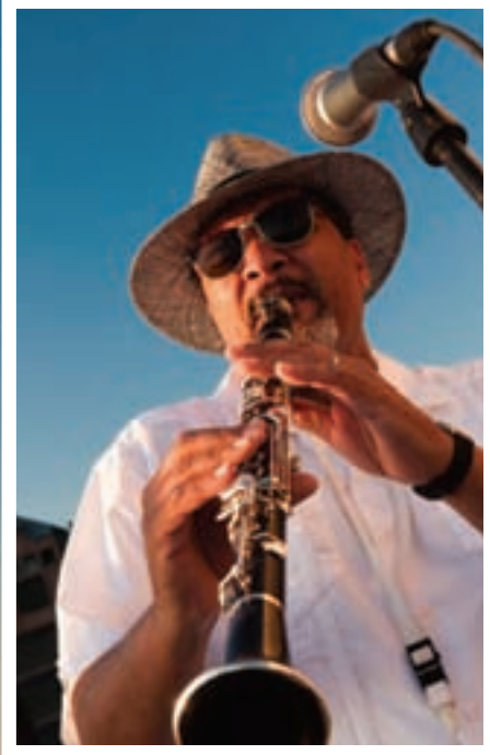
Cool jazz and a tapas menu attracts the after-work crowd at Sunset Atop the Madison at the Madison Hotel.