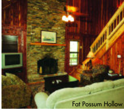
Fat Possum Hollow