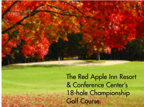
The Red Apple Inn Resort & Conference Center's 18-hole Championship Golf Course.

the Ozark Mountains. The luxury cabins are furnished with all the comforts of home including linens, kitchenware, appliances and stone fireplaces. Each cabin sleeps six to eight people, and all have decks with spectacular river views.