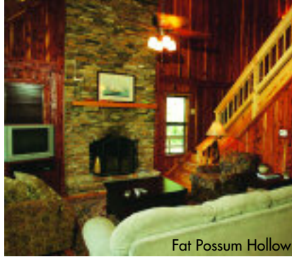
Fat Possum Hollow