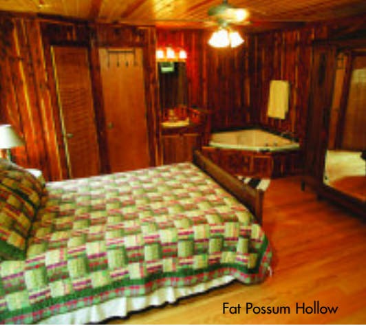
Fat Possum Hollow